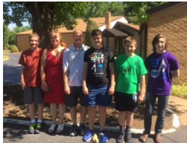
2017 Mission Trip Group gets ready to set off on their trip

See the Mission Trip Commitment Form below. Watch for more details as we get closer to our trip!